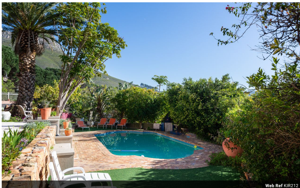
Web Ref KIR212