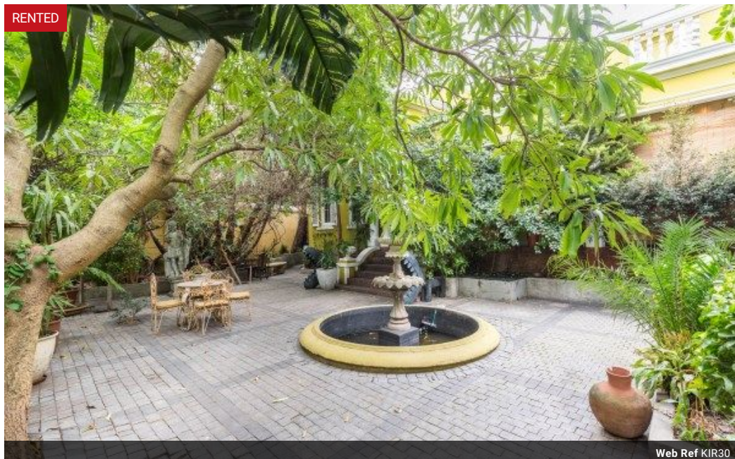
Web Ref KIR30