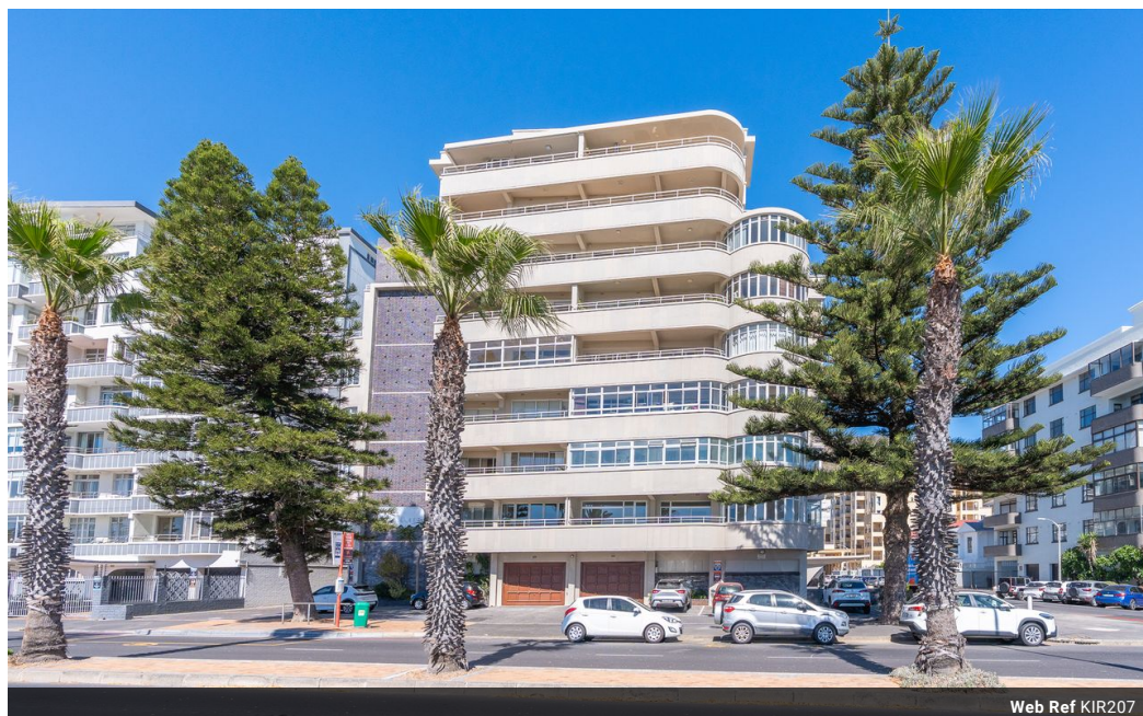
Web Ref KIR207